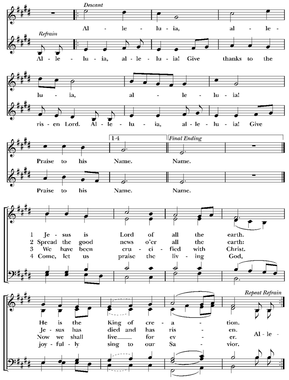
The descant may be sung after stanzas 3 and 4.