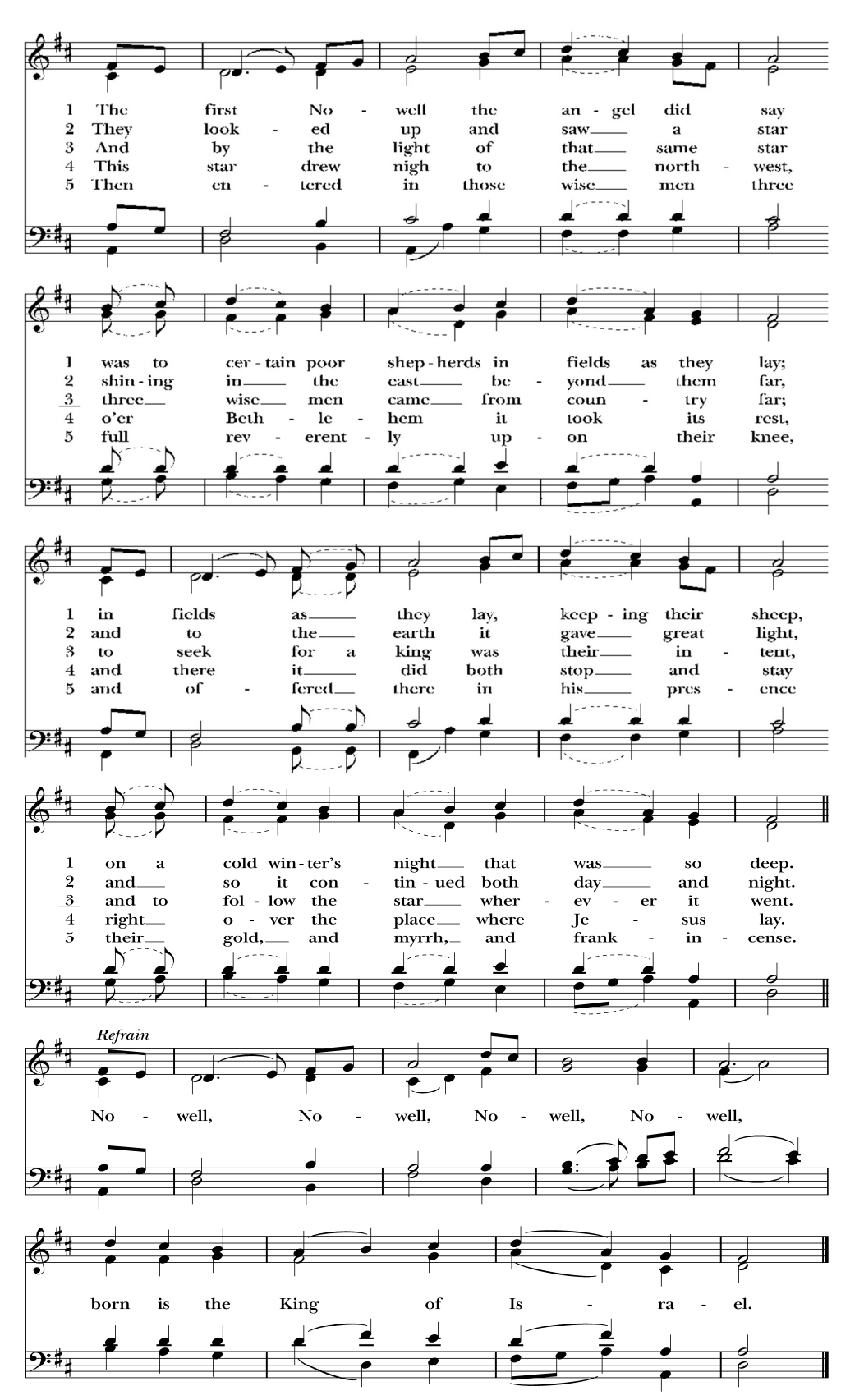
Then let us all with one accord sing praises to our heavenly Lord; that hath made heaven and earth of nought, and with his blood our life hath bought.